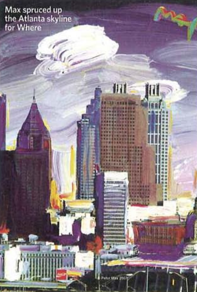
Max spruced up the Atlanta skyline for Where

Born in Berlin in 1937 and raised in China and Israel before settling in the U.S., Peter Max made a name for himself in the '60s. "1969 was the best year of my life because three major things happened," Max says. "A man went to the moon, Woodstock and Life Magazine did an eight-page cover story on me." Well, the party still hasn't stopped for the prolific artist who credits his success (and longevity) to his sense of fashion, current events and music. "I can't wait to get to the studio," he says. "At night, you have to kick me out. It's like a playroom for me." There he works on etchings, ceramics, and paintings on canvas and paper. "I just go with one thing — the will to paint," he says. In addition to large museum exhibits, Max presents smaller gallery shows (about 30 a year), and is working on 22 art books and an animated movie set to music. Make sure to ask him where he gets all his energy when he visits Atlanta's Wentworth Gallery June 23 from 6-9 pm. 4400 Ashford Dunwoody Rd., 770-913-0641.